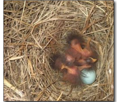
Eastern Bluebird nestings