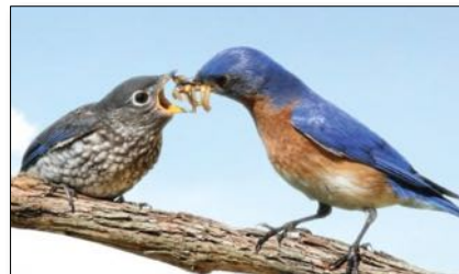
Bluebirds like bees too

Today, the wrens and their fledged chicks are feeding around the hives, picking up DEAD bees from the ground. In that regard, it's a favor to me because dead bees can attract other predators like hornets or skunks who could do more harm to the bees. So, I hope they keep at it!