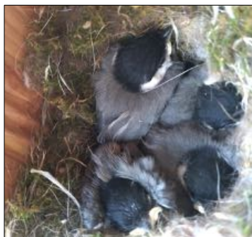
Both Carolina Chickadees and Wrens have used our nestboxes