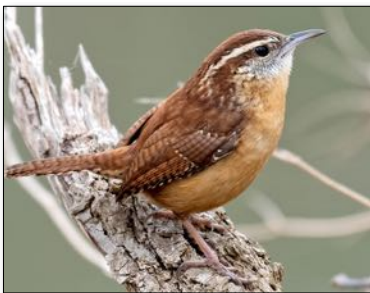
Carolina Wren seeks insects

Most mornings, a pair of cardinals check the porch gutters for bugs and other tidbits. The wrens fledging a clutch in the barn do a fine job gathering insects and tidbits to feed their chicks. Some days, I'm scolded for interrupting their routine and other days they ignore me. They are noisy and busy keeping their babies fed and safe.