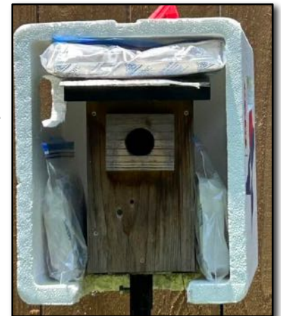
Wendy W. Lime shares a creative way to help protect eggs/babies

Three baby bluebirds surviving the 103 heat here in Spring Texas. Changing out the ice packs twice a day in the styrofoam a/c unit!"