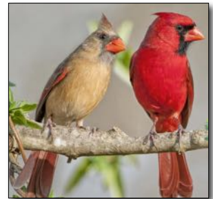
Cardinals love bees

That's not to say the wrens and cardinal don't eat bees. Occasionally hungry birds are interested in the bees. Just like a rancher, it's my job to monitor and protect the bees.