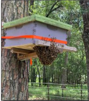
Swarm on a bait hive

As a hobbyist beekeeper, I keep 18 hives on my small acreage just north of The Woodlands. I confess that over