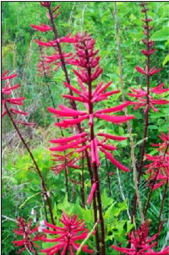
Coralbean Erythrina herbacea . This plant is blooming right now.

Visit TBS Facebook page - Great photos, videos, and stories!