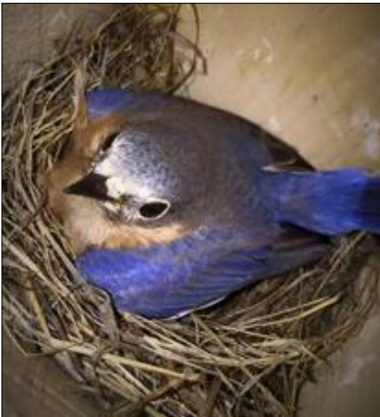
Beautiful Mom on her nest!