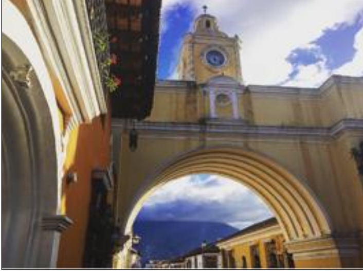
The famous "arch" of Antigua. Santa Catalina Arch.