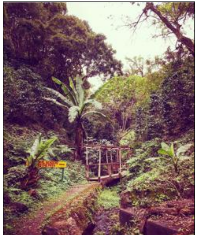
The mountain forests of Finca El Pilar.

It's world renowned for the variety of hummingbirds that visit there as well as TONS of other species that are endemic to Central America.