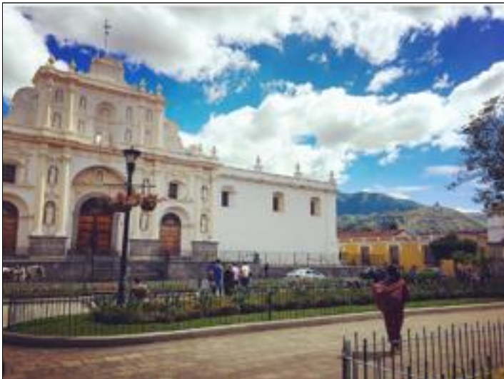
The old architecture of the main central square in Antigua

I spent the week of Christmas 2016 in the Central American country of Guatemala. I'm half Guatemalan even though most people think I'm joking when I say that due to people's biases on what a Latina should "look like" (I'm light skinned with blue eyes). Since childhood, I've either lived there for a few months or visited once or twice a year (during my school years in the states). But, since having my own child, I've only be able to visit my family there when kid and husband schedules allow for it. While I have always had an interest in birds, my passion for care and conservation (particularly for migratory/cavity nesting species) only developed in the past 4 years. I didn't realize how much I was missing out by not going on birding adventures until this most recent trip. And BOY was I missing out! It almost makes me mad that I didn't become an ornithologist after my experience in the mountains of Guatemala, but at least I had one of my most memorable moments there yet.